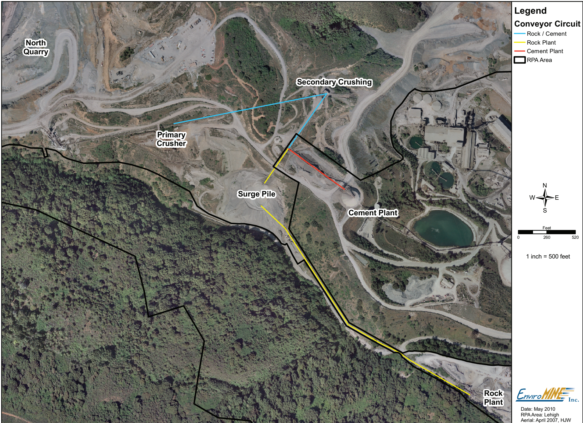
Figure 3.3-3 Quarry Conveyor Circuit